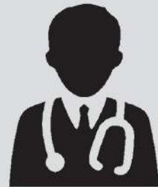
Seek medical help