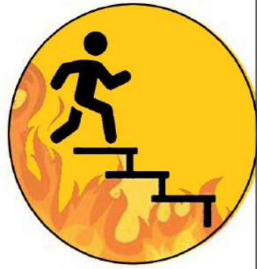
Use the staircase if you are trapped in a high rise building