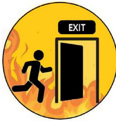
If trapped, find a safe passage to exit the building