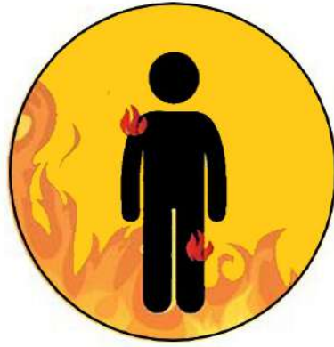
Do not run if your body catches on fire, Stop, drop and roll to put out the fire