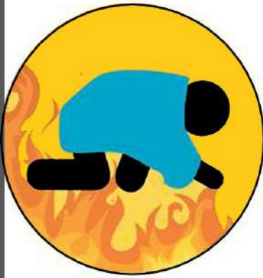
Grab a blanket (wet it if possible), wrap your body around it and crawl out