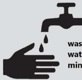
wash with tap water for 10 minutes