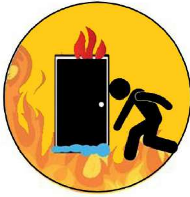
If doors are on fire, wet some clothes and place them under the door - it will stop smoke from entering the room