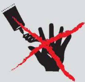
Avoid using remedies such as toothpaste to treat burns on body