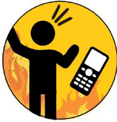
Shout for help and call Fire Service