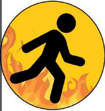
Escape to a safe place