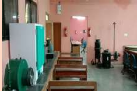
Advanced Bioenergy Lab