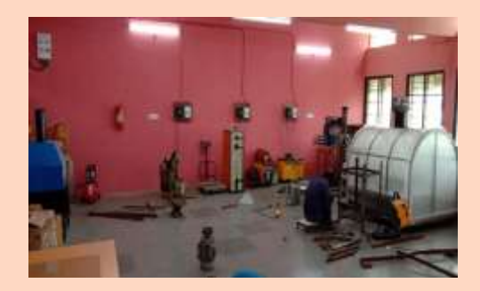
Renewable Energy Fabrication Lab