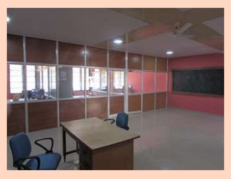
Solar Energy Lab