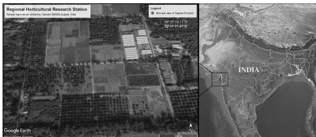
Figure 2. Map of the Sapota fruit and soil sampling area

The study was carried out at Regional Horticultural Research Station, Navsari Agricultural University, Navsari, Gujarat, India using sapota variety, kalipatti under tropical agro-climatic conditions of India during year 2017-18. The farm is located at 20° 55' 18.11" N and 72° 53' 27.47" E at an altitude of about 10 m above mean sea level (MSL) (Figure 2). According to agro-climatic condition, Navsari is situated under South Gujarat heavy rainfall zone-I (Agro-ecological situation-III). Minimum and maximum temperature varies from 17 °C to 22 °C and 31 °C to 36 °C with an average annual rainfall about 1400 -1800mm. The soil of the experimental field was clay in texture having pH 7.5-8.3, EC 0.3-0.6 dS m -1 and organic carbon content of 0.6-0.68%.